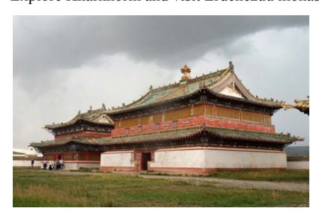
Day2. Drive to Kharkhorin, ancient capital of Mongolia and Erdenezuu monastery (B/L/D) Explore Kharkhorin and visit Erdenezuu monastery. Kharakorin is the ancient capital of Chingis KhaanÊs

Mongolia and was established in 1220 and served as the capital for 140 years. The Monastery was built in 1586 and is surrounded by a massive 400m X 400m wall. Only a few temples remain standing after the communist purges of 1930s. In previous times the grounds held over 60 temples with 10,000 monks using them for daily worship. Stay in ger camp (About 300kms-about 5-6 hours driving)