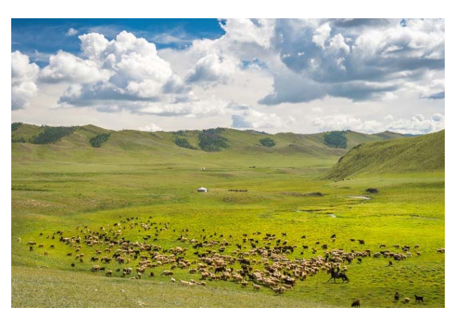
Day5. Drive to Orkhon Valley and Waterfall (B/L/D)

Today, we will drive to Orkhon valley, registered as World Cultural Heritage by UNESCO in 2005, this Orkhon River valley is known as the cradle of the Mongolian civilization holding many of Mongoliaĥs ancient monuments lie within its basin. We will walk to Orkhon waterfall also called UlaanTsutgalan, formed by a series of volcanic eruptions about 20.000 years ago. It cascades from the height of 22 metres and is