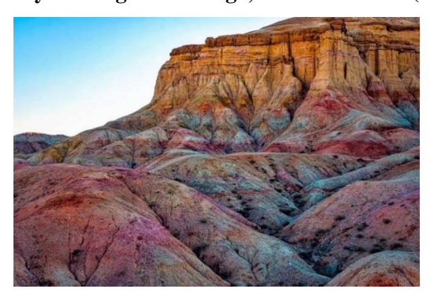
Day10. Tsagaan Suvarga, rock formation (B/L/D)

We will drive to Tsagaan Suvarga. The scarp of Tsagaan Suvarga is located in Ulziit soum of Dundgobi province. It is interesting to see the sheer slope, facing east, which from cliff is 30 meters high and 100 meters wide. Over thousands of years the wind has created this amazing structure. Stay in ger camp (about 280kms -About 4 hours driving