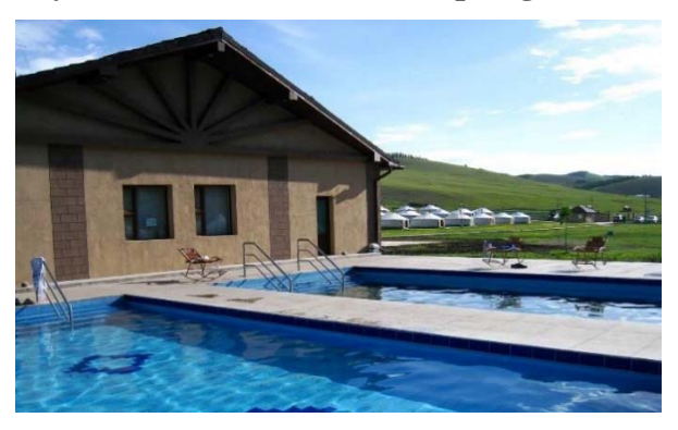
Day4. Drive to Tsenkher hot spring (B/L/D)

After breakfast, we will drive to Tsenkher hot spring, Mongoliaß most famous hot spring is located in Tsenkher village. This natural beauty is located 27km south from Tsetserleg town which is the central town of the Arkhangai province. The hot spring surrounded by cliffs and rapid rivers is located between woody hills and breathtaking mountains. Stay in the ger camp