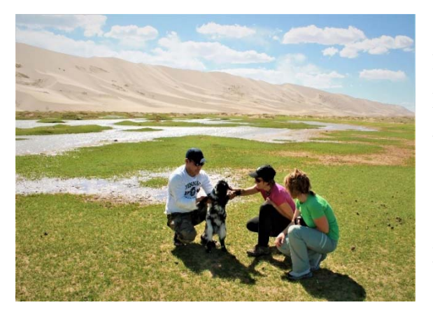
Day8. Drive to Khongor sand dunes and hike to the sand dunes (B/L/D)

Today we will drive to Khongor sand dunes. At 28 m in height the giant sand dunes stretch lengthwise some 180 kms. Sometimes the area is only several hundred meters wide but can grow to 7-20 kms. We will hike to the top of the sand dunes. It is possible to make camel riding. It is around 15USD per person. Stay in ger camp (about 150 kms- About 4 hours driving)