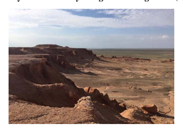
Day7. Drive to Bayanzag or Flaming Cliffs (B/L/D)

In the morning we will drive to the Bayanzag area. Known as a Flaming Cliffs "Cradle of Dinosaurs" this is where the first nest of dinosaur eggs ever discovered was found in 1922. A site famous for the remains of dinosaur that lived here 60 million years ago. You can walk around where dinosaurs once roamed and see saxaul trees and other classic desert vegetation. Stay in ger camp (About 150- about 4hours driving)